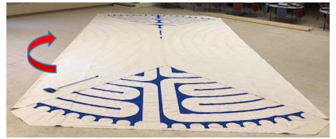
Step 2 – fold one side toward centerStep 3 – Fold other side toward centerLeave about one-inch of open space at the center, sweep newly exposed underside