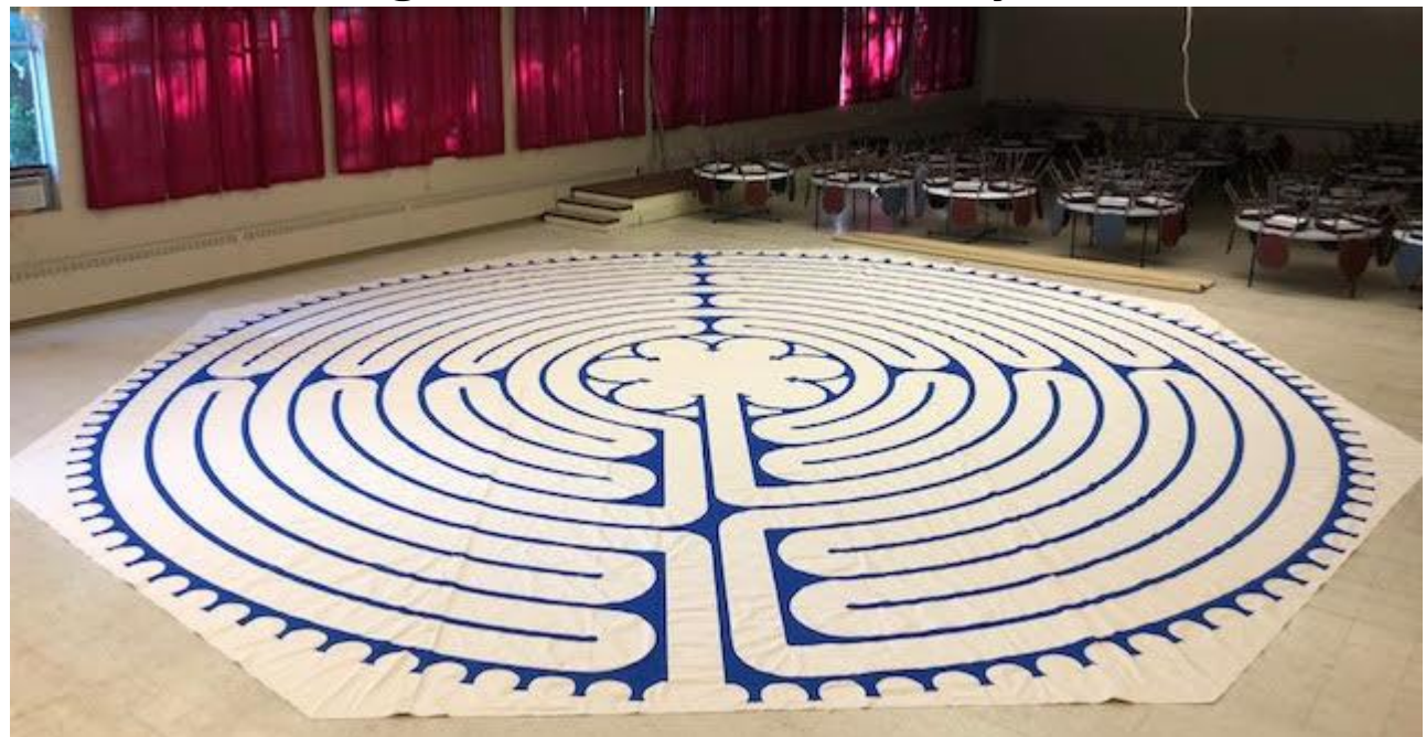
Step 1 – Sweep top surface of the canvas with a broom dedicated for use on the labyrinth only