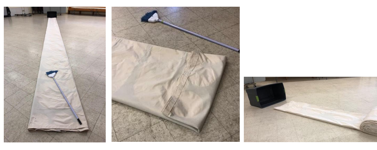
Step 8 – Fold the right side completely over the other side

Step 9 - Begin at far end opposite the entrance...Fold/roll sweeping as needed all the way to other end