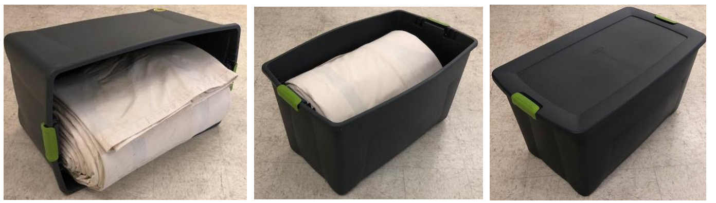
Step 10 – Roll into storage container

Step 9 - Begin at far end opposite the entrance...Fold/roll sweeping as needed all the way to other end